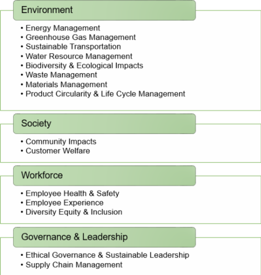
Figure 1: Green Masters Program® Dimensions and Topics